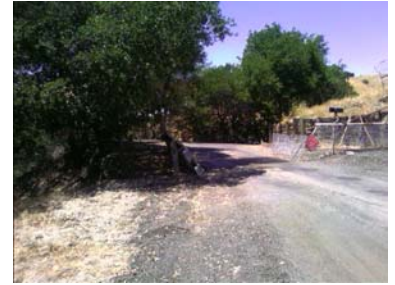
Entrance to property on north side while traveling south on Christie Road from Hwy 4.

Christie Road Martinez, CA 94553 Asking $689,000 Pristine and Private 8 (+/-) acres of flat land. Remaining acreage gently rolling hills. All usable.